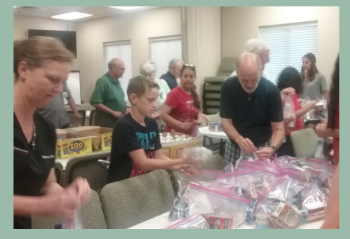
Assembling care bags

This summer, we gathered together for Acts of Service on Wednesday evenings after worship. It was a wonderful time of intergenerational fellowship and service. Thanks to all who participated!