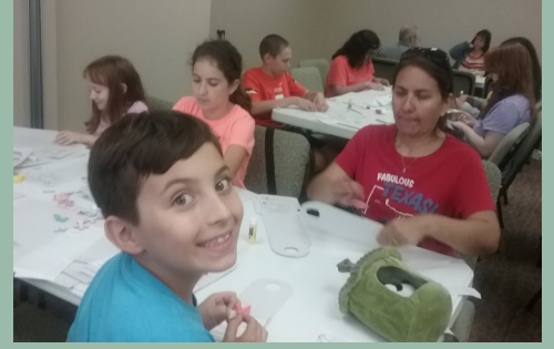
Creating door hangers with information about the Ministry Center