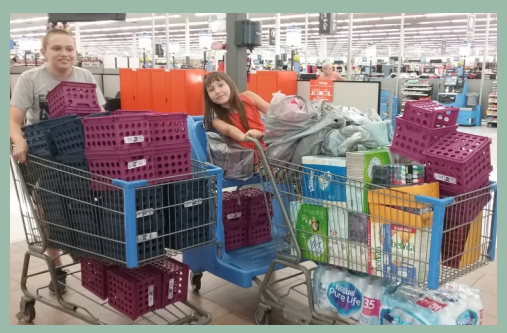
Shopping for items for the teacher blessing baskets